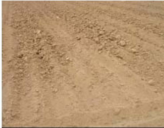
Figure 5. Pre-irrigation tillage (Pré-irrigation de travail du sol)

This paper has recommended several better field water management and soil moisture conservation measures: